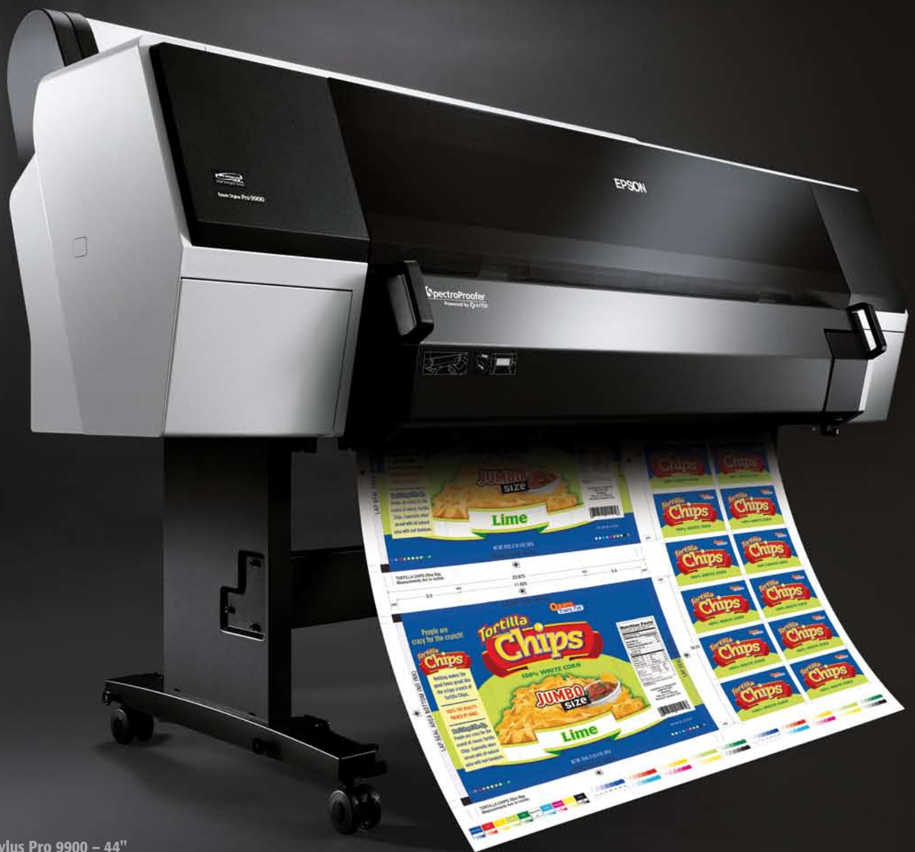
Epson Stylus Pro 9900 – 44"