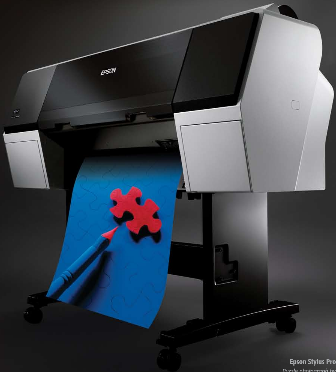
Epson Stylus Pro 7900 – 24" Puzzle photograph by Jeff Schewe