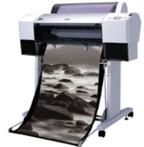
InkStar 17 Film Printer