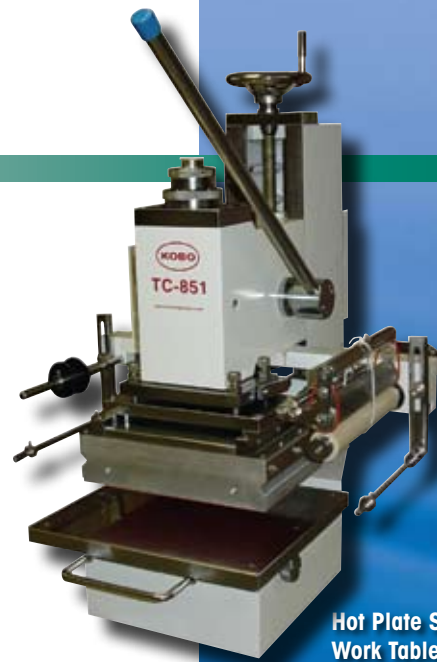
Hot Plate Size 12"x 7.6" Work Table Size: 12.5" x 15" 200 volt/single phase/15 amps. Size: 26" L x 23"W x 36"H Weight: Approx. 450 lbs.

Best of all, these machines are user friendly so even a novice can produce professional results.