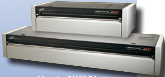
Liberator GMAX 54 Max Size: 54"x 53.75" 115 or 230 volt/VAC/50-60hz. Size: 21" L x 63"W x 11.25"H Weight: Approx. 232 lbs.