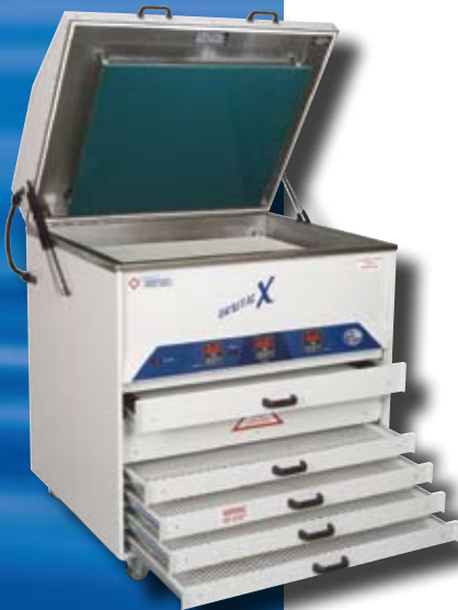
Max. Sign Size 24"x 30" 220 volt/single phase/60hz. Size: 40" L x 42"W x 48"H Weight: Approx. 720 lbs.

A dual orbital-action platen provides efficient and smooth washout and a digital timer assures accurate washout times. The brush height is adjustable to suit your sign gauge requirements. The exposure section is located in a drawer below the washout section and is equipped with a digital timer, vacuum pump and electronic solid-state ballasts. A thermostatically-controlled, 3-drawer dryer uses forced air to efficiently dry the sign material. Each drawer is mounted on its own drawer slides.