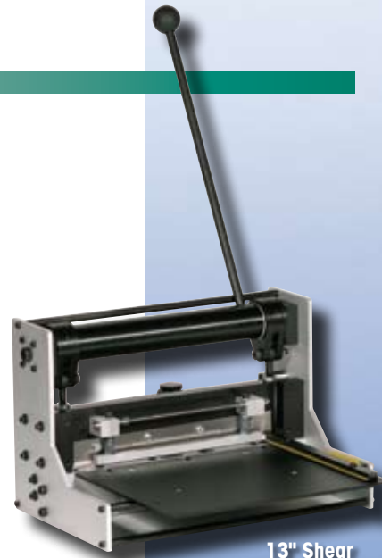
13" Shear Weight: Approx. 85 lbs.

The 3001 Series was designed by accucutter® and is an accucutter® exclusive. These shears are made in the USA entirely of American materials.